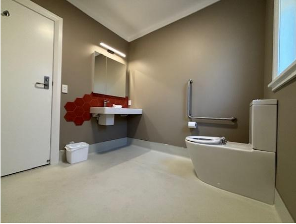
New Lifemark Rating bathrooms in Vincentian Cottage