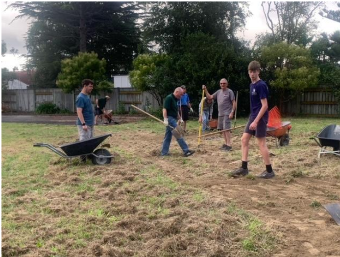
A Team of volunteers from Fitzherbert Lions working hard on grounds maintenance at St Mary's.