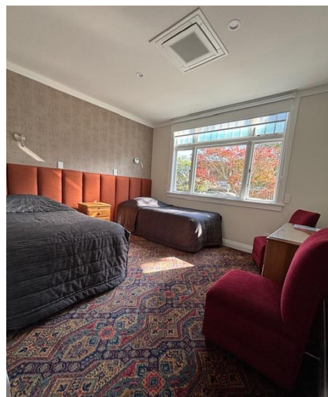
New front entrance ramp and refurbished bedroom, Vincentian Cottage