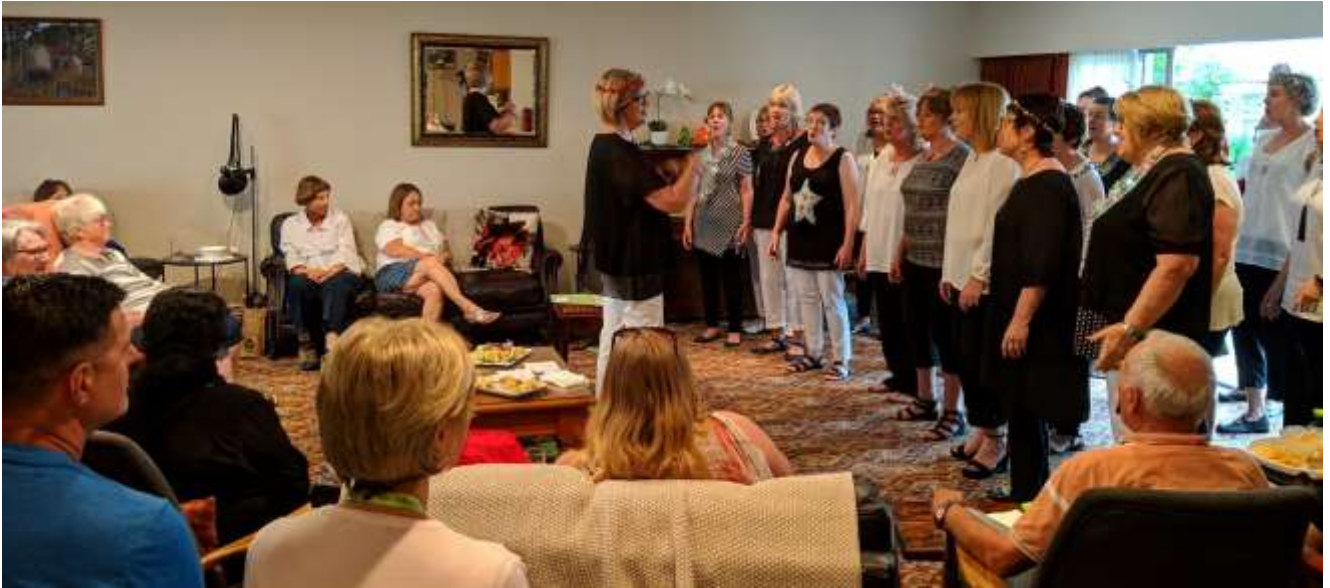
Christmas 2018 – The Manawatu Overtones a barbershop style, women’s singing group

The Trust hosted the annual guests Melbourne Cup day and Christmas party which was enjoyed by all.