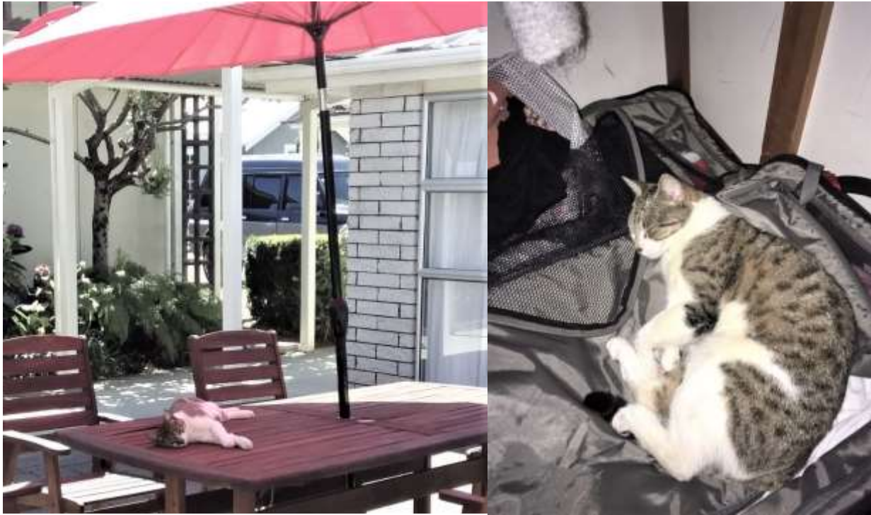
Ruby the movie star languishing in the shade outside Urquhart and socialising with a guests!

Once again our benefactors have been extremely generous. In addition to donations of $115,392, bequests of $14,636 were received. We enjoyed the goodwill and support of our local authorities. The Trust benefits from a rates remission from the Palmerston North City Council and Horizons Regional Council of $21,243 / LY $23,366 respectively, this support is much appreciated. The Board is disappointed that the Palmerston North City Council will remove over 3 years the rate remission it has earlier enjoyed as it was not entitled to an automatic remission under the Rates Act and further did not qualify under Council Policy because it did not support city residents. Uniform service charges around $26,000 are paid annually. The Trust has conveyed its dismay at the attitude of the Council which has failed to recognise the economic benefit that the facility brings to the City while at the same time financially supporting entertainment, sporting, conventions and other events.