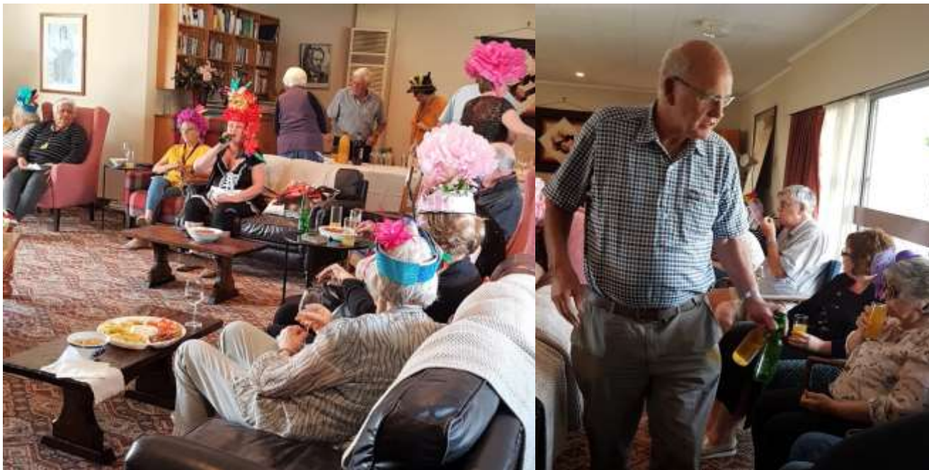
Guests sporting hats they created at the Melbourne Cup party -