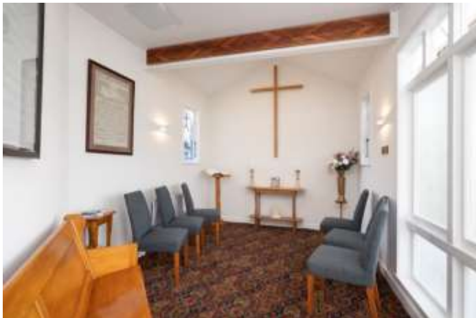
Chapel – Refuge - Quiet Space