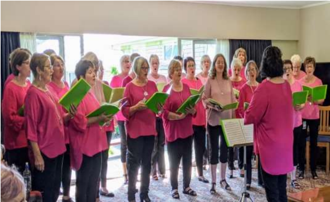
Local group, Manawatu Overtones. Entertain guests at the 2020 Christmas Party

accommodation during that time. As changes are forecast in the delivery of health and Cancer treatment services in the regions, the Trust is continuing to actively explore future alternative options for fulfilling a need within the community.