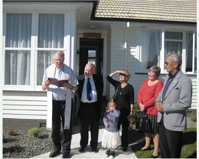
Right: Opening Finnigan House