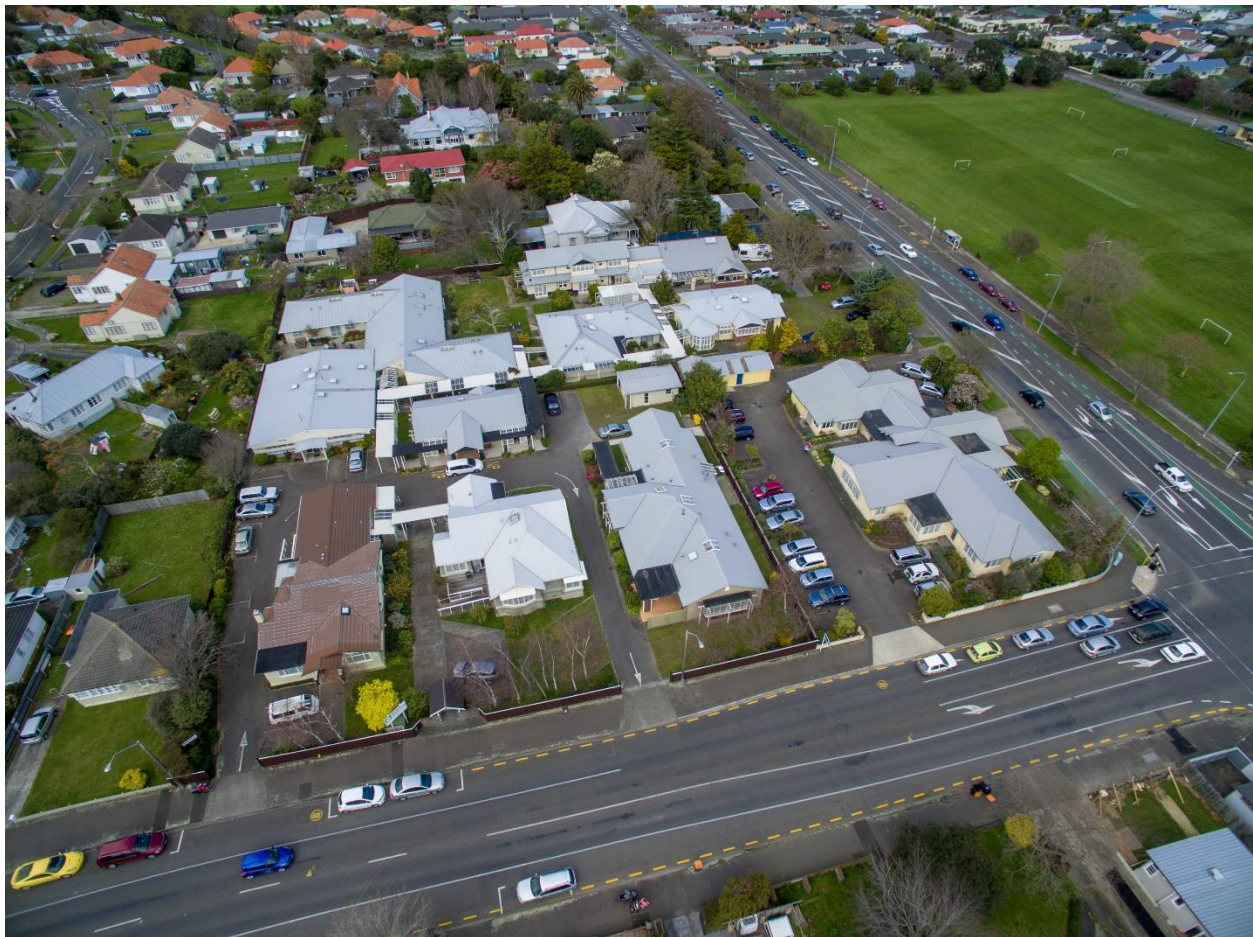
Aerial view Ozanam House, Featherston Street, Ruahine Street, 2017

Once again our benefactors have been extremely generous. In addition to donations of $156,129, bequests of $385,123 were received. We enjoyed the goodwill and support of our local authorities. The Trust benefits from a rates remission from the Palmerston North City Council and Horizons Regional Council of $21,069 / LY $18,391 respectively, this support is much appreciated.